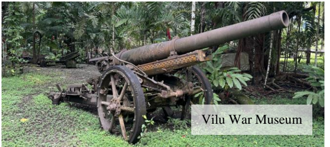
Vilu War Museum