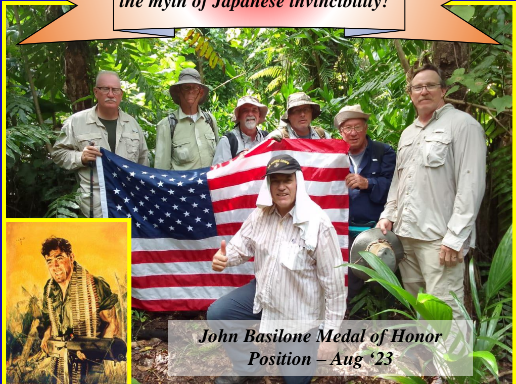
John Basilone Medal of Honor Position – Aug '23

“The Allied victory that destroyed the myth of Japanese invincibility!”