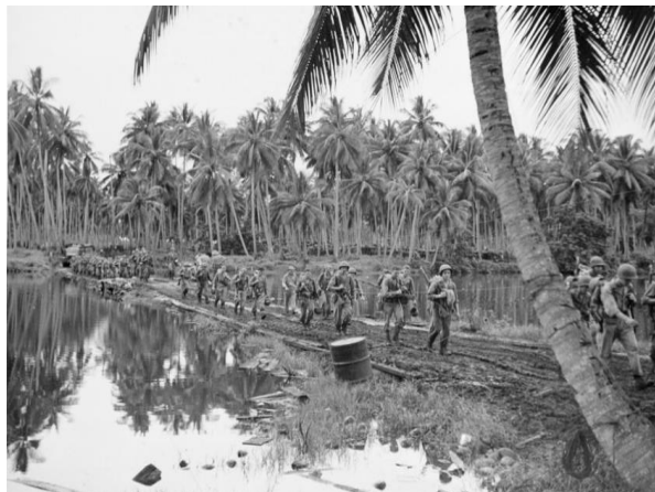
GUADALCANAL: an emotion, not a name